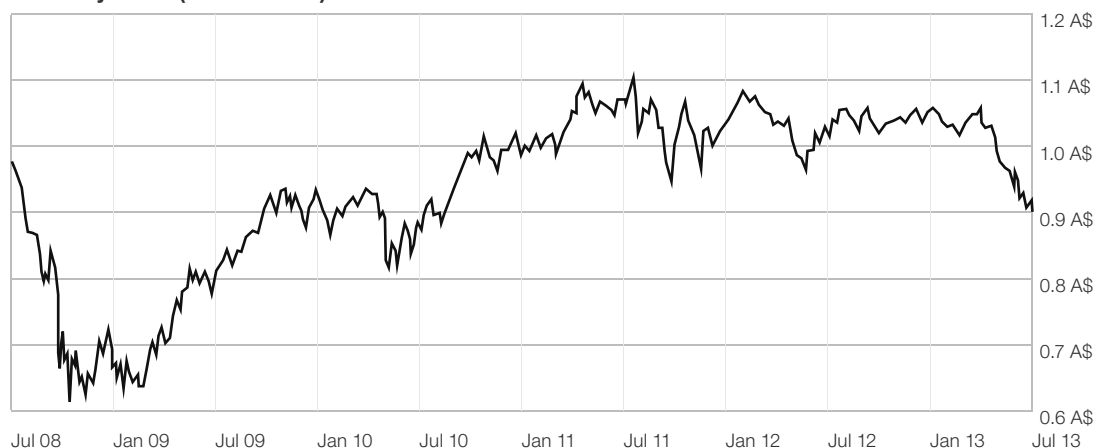
Currency Chart (AUD vs. USD)

As the exchange rate graph shows, after briefly pushing above US$1.10 in 2011, the Aussie dollar hovered between US$1.01-1.06 for much of the past year before making a decisive retreat.