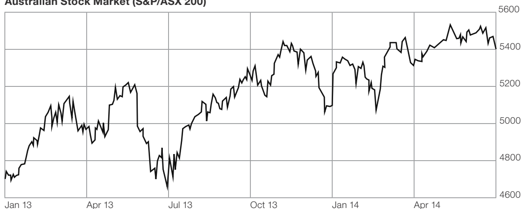
Australian Stock Market (S&P/ASX 200)

By contrast, India is on the march with annual growth of 4.6 per cent in the March quarter tipped to rise to 5.4 per cent by the end of 2014 and a further one per cent in 2015.